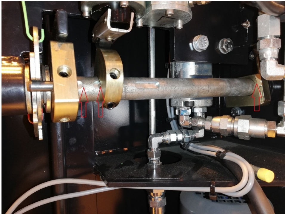
Picture 2 Door with keyway